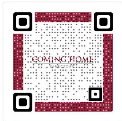
Scan QR code to visit Coming Home Directory website

Update requests can be submitted via email at cominghomedirectory@cjinstitute.org or by filling out the “CHD Annual Updates & Opt-in” form linked here . You can also find copies of the form on the website by visiting the “Documents” page. The website is updated as quickly as possible and includes the most recent information available. The printed version of the Directory is updated annually. The Directory is designed to connect people to services. The information for each organization in the printed version and on the website has been provided by the service provider or obtained from the organization’s website. The editors cannot and do not assess the accuracy or quality of the services available.