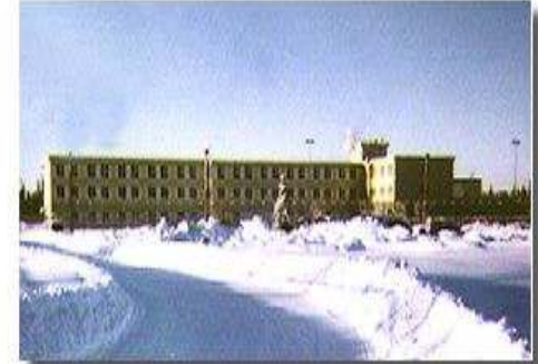
Kenai and Seward RESOURCE LIST

Spring Creek Correctional Center Mile 5 Nash Road PO Box 2109 Seward, Alaska 99664